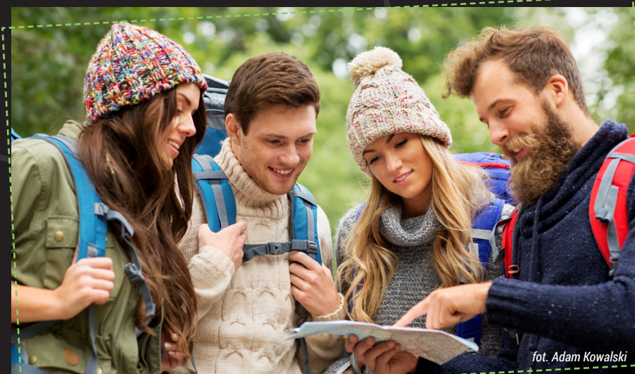
fol. Adam Kowalski

Hikes can be started from the easier trails, to with time enter more difficult levels and conquer longer and more demanding trails. All are marked out in such a way as to cover both the natural treasures or interesting landscapes, as well as human creations, including regional symbols and secrets. While following Pomorskie trails, we will come across the more than 500-year old grand Bartuś oak in Park Narodowy Bory Tucholskie [Bory Tucholskie National Park], that with its name alludes to the Polish record-holder, the around 700-year-old "Bartek" from the Świętokrzyskie Voivodeship. Unforgettable moments will be ensured by the red trail in Słowiński Park Narodowy [Słowiński National Park] that leads in its first part across the Baltic Sahara, that is dunes Łącka and Czołpińska. The highest hills on these trails are natural overlooks of the whole Park. It is also worth stopping on a yellow trail of Park Krajobrazowy Dolina Słupi [Słupia Valley Landscape Park] and taking a moment to see a huge glacial erratic, not by a coincidence called a dragon egg. It was moved to the Pomorskie Region ages ago by an ice sheet, and to this day baffles with its size.