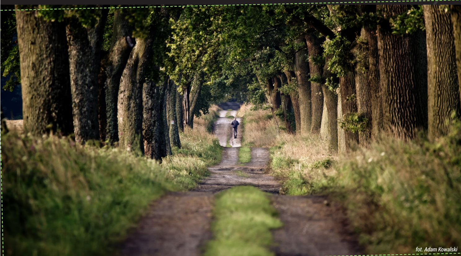
fol. Adam Kowalski

Comfortable shoes, a detailed map, also a working GPS can be useful. Moreover, packed lunch, a bottle of water and a raincoat just in case – you do not need much to start an exciting adventure during hikes on tourist trails, and there are many of them in Pomorskie. The most interesting trails in the region can be found in the area or in the buffer zones of Pomorskie nature protection areas – two national parks (Słowiński, Bory Tucholskie), as well as 9 landscape parks.