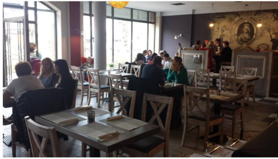
Mandu is THE place to go for tasty pierogi in Gdansk

Vegetarian? Head to Wajdeloty street, there's a vegan bistro, a vegan café, and most of the nearest restaurants have vegan and gluten-free dishes too. There's even a vegan, gluten-free pizzeria!