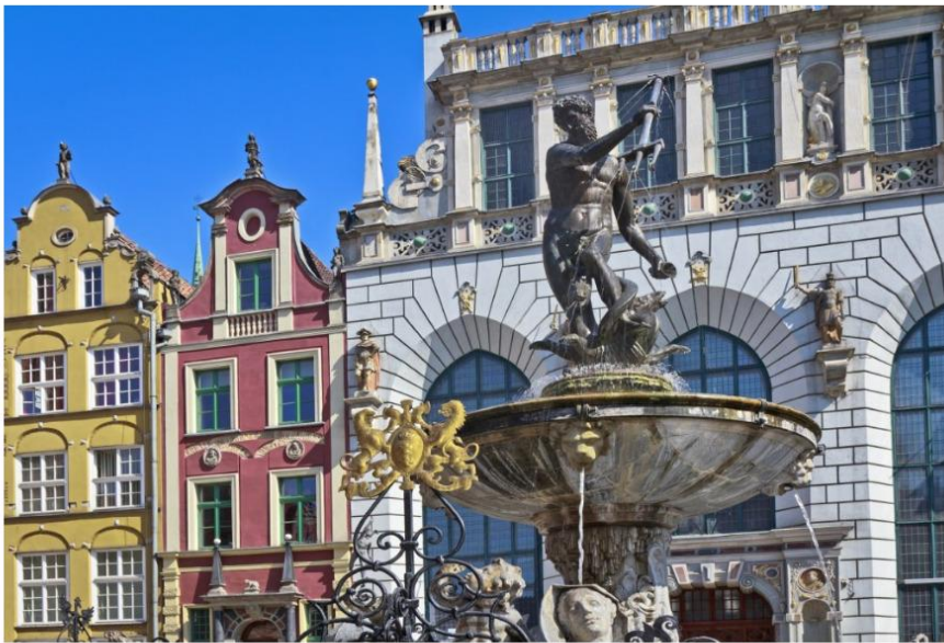
The Neptune fountain in Gdansk

Spring is the best time of the year to come to Gdansk, the weather is starting to get warm, so it's perfect for taking walks and going sightseeing. Plus, you get to see the city before it fills up with tourists. If you don't like crowds, autumn is another great time to pay a visit.