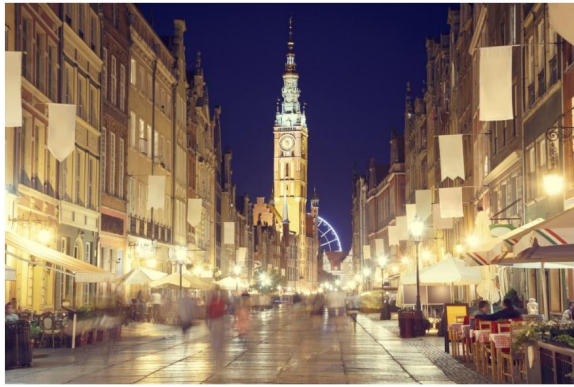
Gdansk's Old Town

The Old Town and Main Town areas have the best nightlife, but a lot of people prefer going to Sopot, a city located just next to Gdańsk. Most of the clubs are located around Monte Casino street.