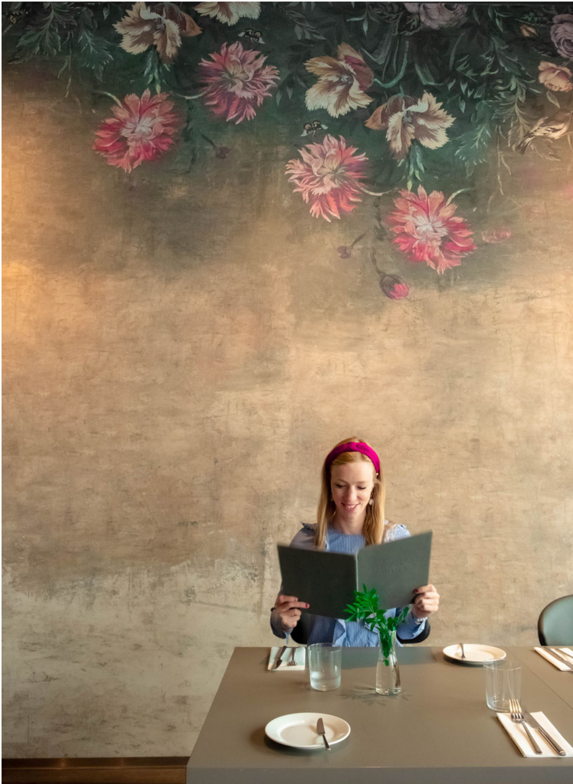
Getting Ready To Order in Sztuczka Bistrot in Sopot

Pomeranian celebrate food (a lot!), but they only use the freshest ingredients to prepare their meals. As the soil is fertile and the coast is always nearby, you can find a lot of food variety in any restaurant you may visit. The Pomeranian cuisine is hearty and, what I call, honest. The vast majority