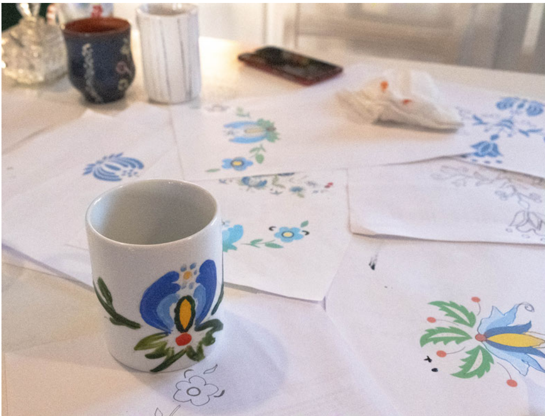
Painting the Kashubian motives on mugs