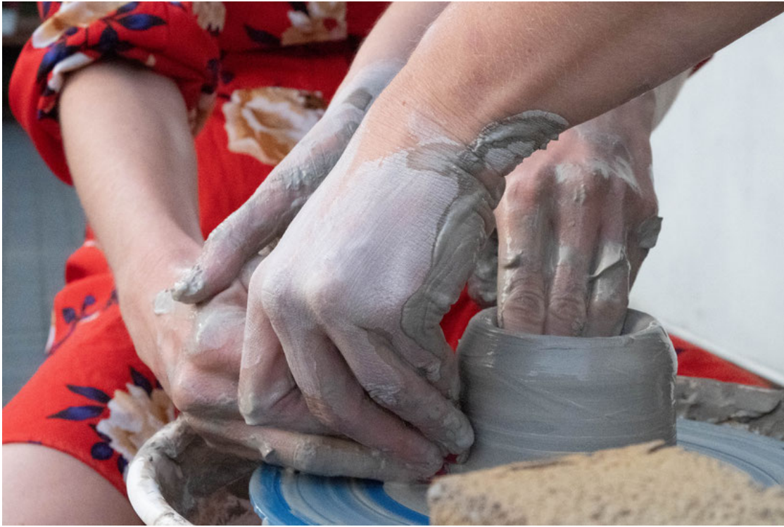
Learning about pottery

Pottery is one of the most ancient Kashubian crafts which has a centuries-old tradition since the middle ages . As in the Kashubian embroidery, the designs are quite simple, but colorful.