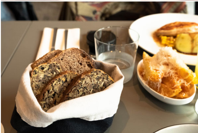
6. Bread Workshop with Award-Winning Karola